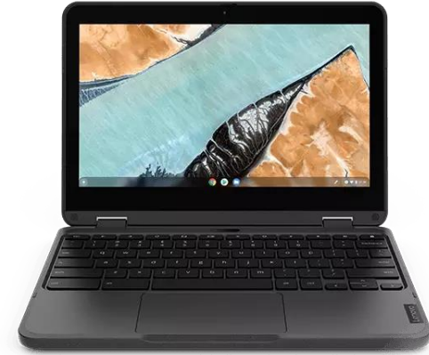
Elementary/Middle School Chromebook