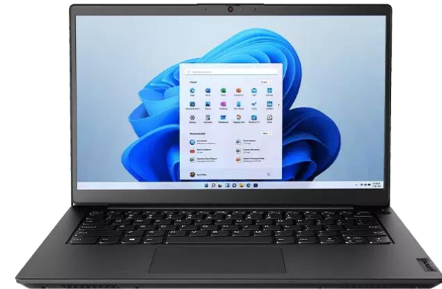
High School Windows Laptop